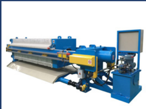
ROBUST, EFFICIENT FILTER PRESSES